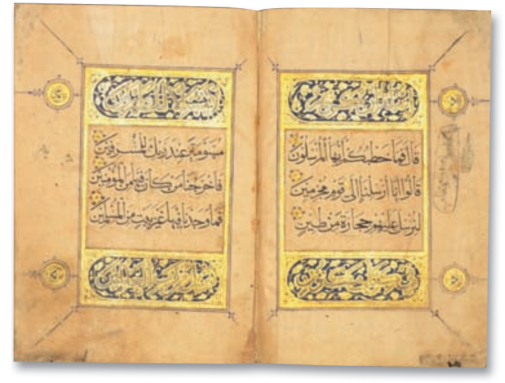
The Muslim World 267

The Qur'an is written in Arabic, and Muslims consider only the Arabic version to be the true word of Allah. Only Arabic can be used in worship. Wherever Muslims carried the Qur'an, Arabic became the language of worshipers and scholars. Thus, the